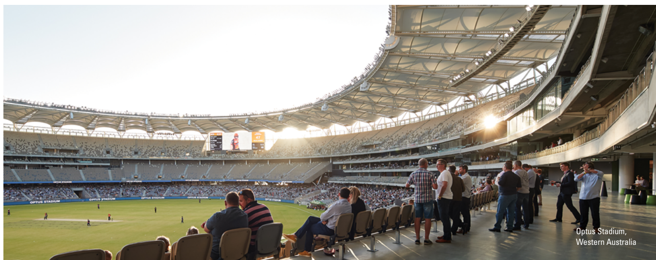
Optus Stadium, Western Australia