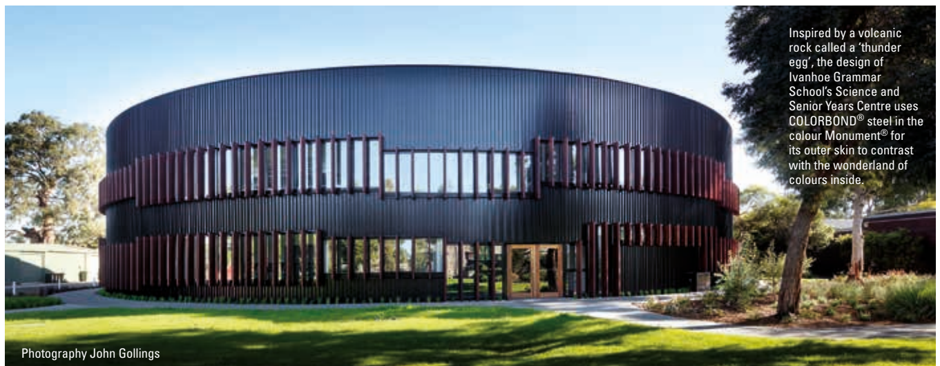
Inspired by a volcanic rock called a 'thunder egg', the design of Ivanhoe Grammar School's Science and Senior Years Centre uses COLORBOND® steel in the colour Monument® for its outer skin to contrast with the wonderland of colours inside.

EPDs are best used to support whole-of-life assessment for end uses such as buildings, infrastructure and their components, as well as everyday materials. Using product-specific EPDs in the context of a whole structure or development enables environmental optimisation and progress towards a better built environment.