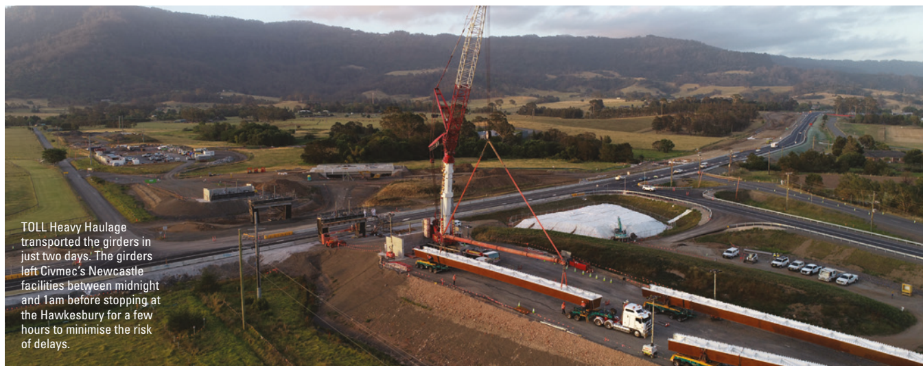
TOLL Heavy Haulage transported the girders in just two days. The girders left Civmec's Newcastle facilities between midnight and 1am before stopping at the Hawkesbury for a few hours to minimise the risk of delays.