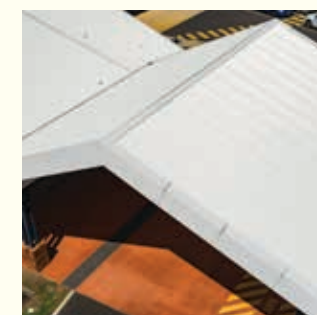
Roof colour: Whitehaven ®

The use of COLORBOND ® Coolmax ® steel in roofing may also reduce the up-front, capital cost of air-conditioning equipment 4 . It could also help reduce the peak cooling load on your building, which may enable you to downsize the capacity of the air-conditioning equipment. 4