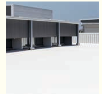
Roof colour: Whitehaven ®

In addition, COLORBOND ® Coolmax ® steel is an enabler to improve NABERS ratings when used appropriately in combination with other factors. 7