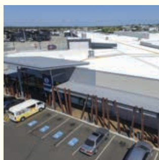
Roof colour: Whitehaven ®

Best of all, COLORBOND ® Coolmax ® steel delivers all the quality, durability, ability to resist dirt and maintain solar reflectance and roofing warranty 3 offer of COLORBOND ® steel.